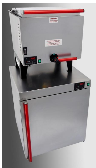
Fango stirrer RW 44, mounted on Heating cabinet WS 14-6044 (assembly example)